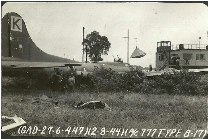
A B17 bomber crash lands next to the control tower (now clubhouse)